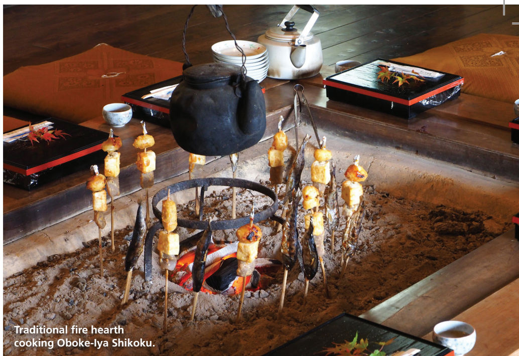
Traditional fire hearth cooking Oboke-lya Shikoku.