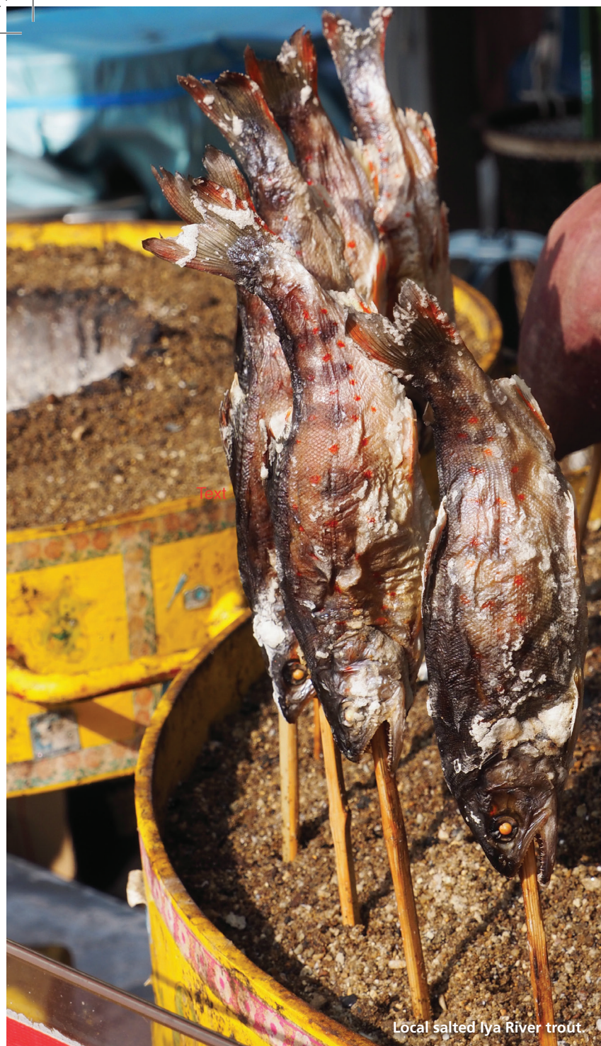
Local salted Iya River trout