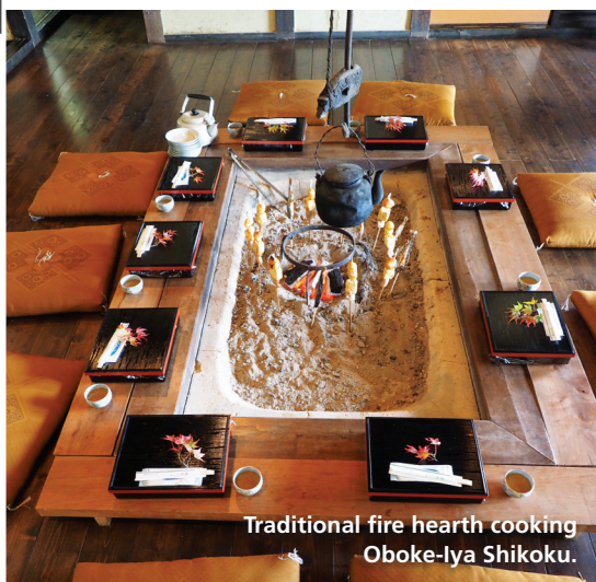
Traditional fire hearth cooking Oboke-lya Shikoku.